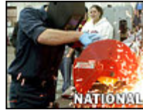
Destroying Crime Guns in Maine