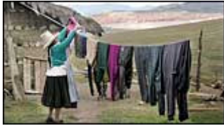
The Cost of Gold: Treasure of Yanacocha