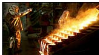
The Cost of Gold: 30 Tons an Ounce

level of contacts and financial support to the military not fully disclosed by Freeport, despite years of requests by shareholders concerned about potential violations of American laws and the company's relations with a military whose human rights record is so blighted that the United States severed ties for a dozen years until November.