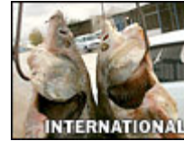
A Curb on Caviar Exports

Copyright 2005The New York Times Company | Home | Privacy Policy | Search | Corrections | XML | Help | Contact Us | Work f