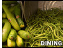
In Oregon, Thinking Local