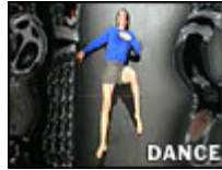
Dance World's 60's Flashback