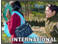
Public Affection in India