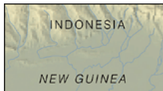
The Cost of Gold