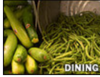
In Oregon, Thinking Local