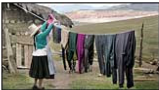
The Cost of Gold: Treasure of Yanacocha