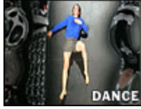
Dance World's 60's Flashback