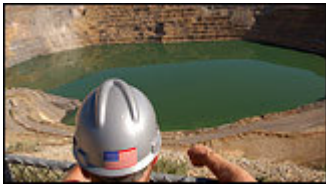
The Cost of Gold