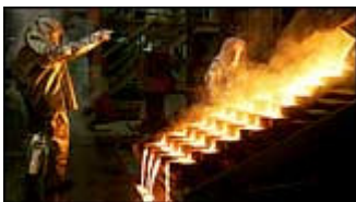
The Cost of Gold: 30 Tons an

Barrick says the effects of its pumping will last at most a few decades. But government scientists estimate it could take 200 years or more to replenish the groundwater that it and neighboring mine companies have removed, with little public attention or debate, as they meet soaring consumer demand for jewelry and gold's price tops $500 an ounce.