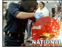
Destroying Crime Guns in Maine