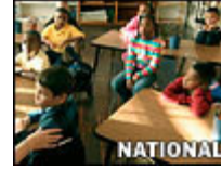
Big Changes for New Orleans Schools

Copyright 2005The New York Times Company | Home | Privacy Policy | Search | Corrections | XML | Help | Contact Us | Work f