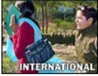
Public Affection in India